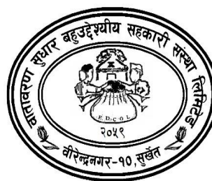
Batabaran Multi-Purpose Cooperative Ltd.