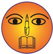
Jeevan Bikas Samaj, Morang